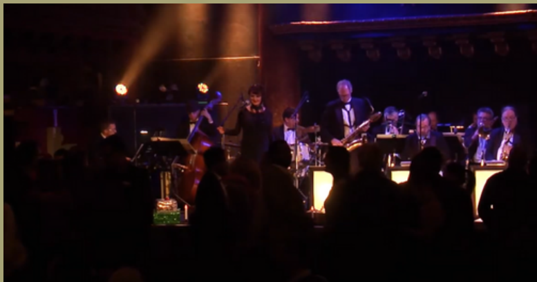
Great American Music Hall with the Mood Swing Orchestra.