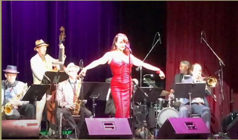
Temptation, Vallejo Jazz Society